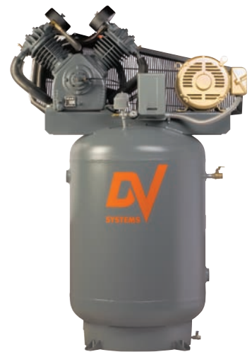
10 hp and 15hp - 120 gal vertical air receiver

DV Systems “V” - four cylinder compressors are a classic pump design proven through decades of use in applications ranging from automotive refinishing to demanding industrial production. The slow speed combined with the excellent cooling of these units creates a virtually unstoppable air compressor. High air delivery combined with simple maintenance, rugged design and efficient operation makes these compressors an exceptional value.