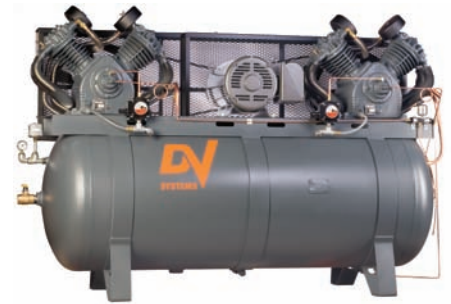
25 hp and 30 hp - 240 gal air receiver